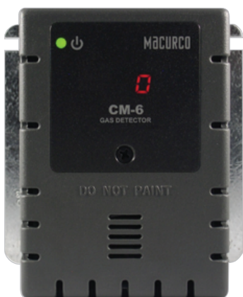
Grey Housing (Standard)