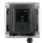
Weatherproof Housing Kit (Detector sold separately)