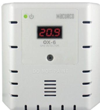
White Housing Option